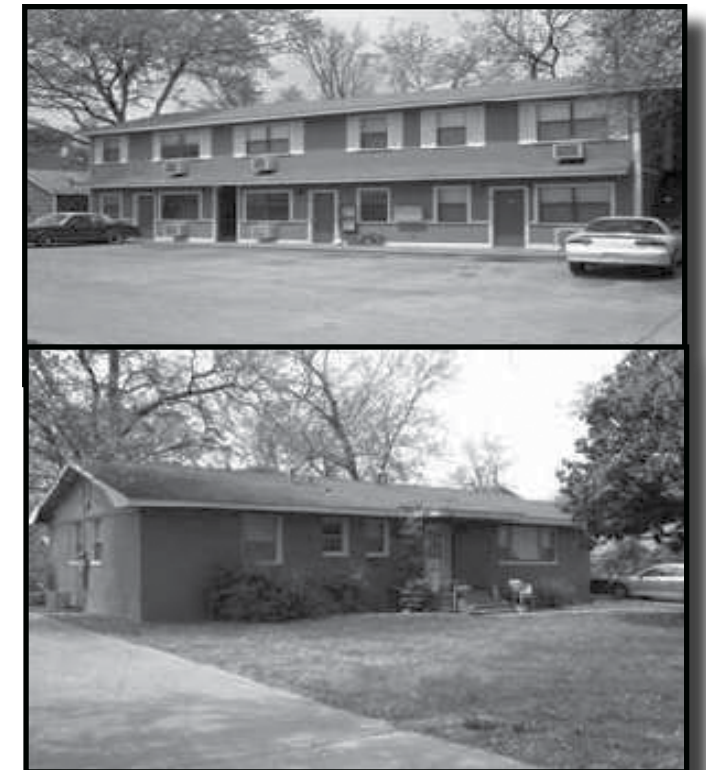
Leverett Complex (U of A)