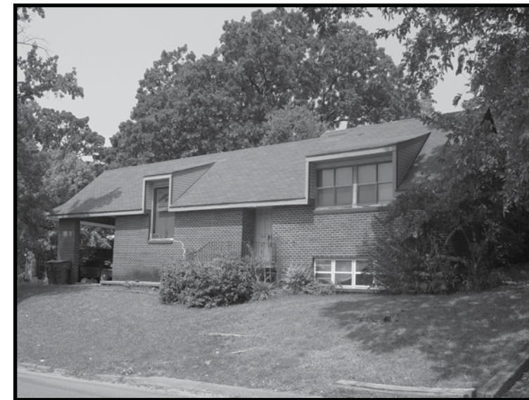
California House (U of A)

for the students who live in the Lightbearers houses at the various campuses. To that end, I will recruit students to participate in this discipleship program, raise up individuals to serve as discipleship coordinators in each property, lead overseas missions trips, and identify opportunities for future growth. Finally, I'll serve as both teacher and counselor, helping these students to incorporate their faith in Jesus into all aspects of their lives while also working to