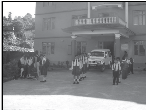
Children At Orphanage Preparing To Go To School

Unsafe drinking water. No ventilation or heating of any sort. Dhaal baat (lentils over rice) for breakfast and dinner, with a snack of rice and tea in the afternoons. No toys, no families, no money, no food. And yet they